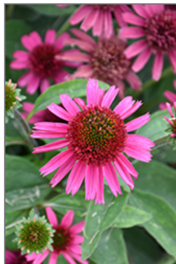
Delicious Candy Coneflower flowers

This is a relatively low maintenance plant, and is best cleaned up in early spring before it resumes active growth for the season. It is a good choice for attracting butterflies to your yard, but is not particularly attractive to deer who tend to leave it alone in favor of tastier treats. It has no significant negative characteristics.