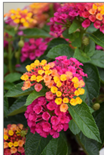
Luscious Royale Cosmo Lantana flowers

Luscious Royale Cosmo Lantana is recommended for the following landscape applications;