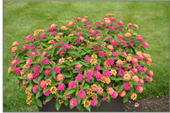
Luscious Royale Cosmo Lantana in bloom

Luscious Royale Cosmo Lantana will grow to be about 18 inches tall at maturity, with a spread of 24 inches. When grown in masses or used as a bedding plant, individual plants should be spaced approximately 18 inches apart. Although it's not a true annual, this fast-growing plant can be expected to behave as an annual in our climate if left outdoors over the winter, usually needing replacement the following year. As such, gardeners should take into consideration that it will perform differently than it would in its native habitat.