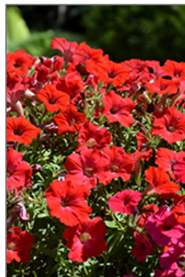
Supertunia Really Red Petunia flowers