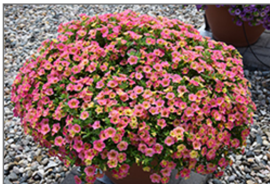
Chameleon Sunshine Berry Calibrachoa in bloom