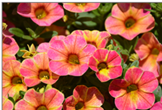
Chameleon Sunshine Berry Calibrachoa flowers