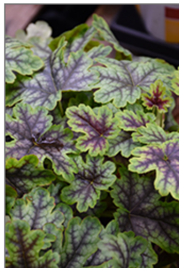
Tapestry Foamy Bells foliage

Tapestry Foamy Bells is recommended for the following landscape applications;