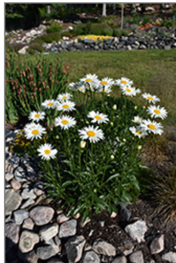
Becky Shasta Daisy in bloom

Becky Shasta Daisy is a fine choice for the garden, but it is also a good selection for planting in outdoor pots and containers. Because of its height, it is often used as a 'thriller' in the 'spiller-thriller-filler' container combination; plant it near the center of the pot, surrounded by smaller plants and those that spill over the edges. It is even sizeable enough that it can be grown alone in a suitable container. Note that when growing plants in outdoor containers and baskets, they may require more frequent waterings than they would in the yard or garden.