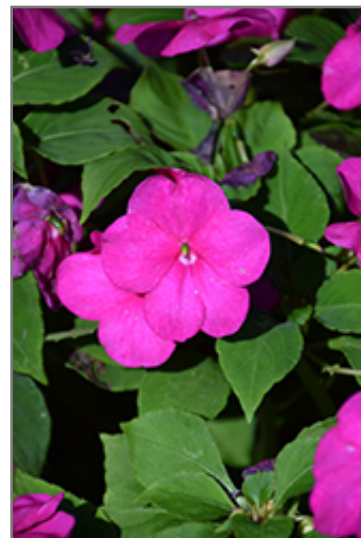
Beacon Violet Shades Impatiens flowers