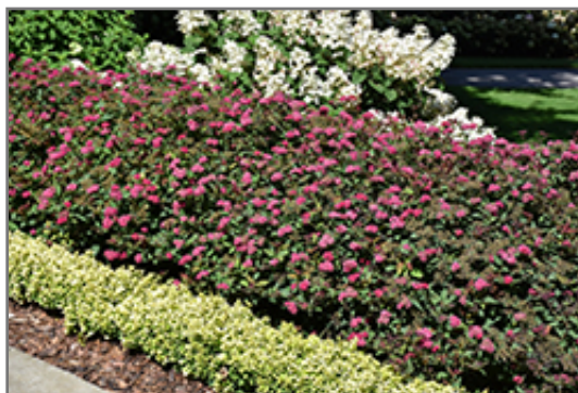
Double Play Doozie Spirea in bloom

This shrub will require occasional maintenance and upkeep, and is best pruned in late winter once the threat of extreme cold has passed. It is a good choice for attracting butterflies to your yard, but is not particularly attractive to deer who tend to leave it alone in favor of tastier treats. It has no significant negative characteristics.