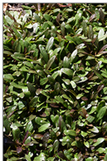
Feathered Friends Noble Nightingale Bugleweed foliage