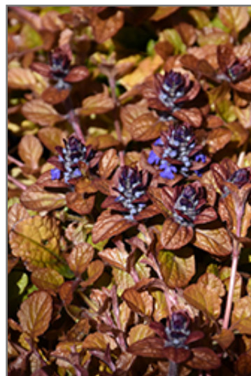
Feathered Friends Parrot Paradise Bugleweed flowers

This plant will require occasional maintenance and upkeep, and should not require much pruning, except when necessary, such as to remove dieback. It is a good choice for attracting butterflies to your yard, but is not particularly attractive to deer who tend to leave it alone in favor of tastier treats. Gardeners should be aware of the following characteristic(s) that may warrant special consideration;