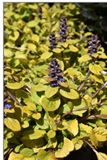
Feathered Friends Tropical Toucan Bugleweed flowers