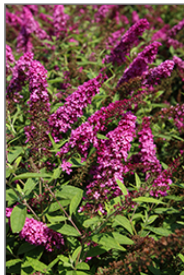
Lo & Behold Ruby Chip Butterfly Bush flowers

Lo & Behold Ruby Chip Butterfly Bush is a multi-stemmed deciduous shrub with a mounded form. Its average texture blends into the landscape, but can be balanced by one or two finer or coarser trees or shrubs for an effective composition.