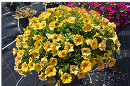
SuperCal Premium Yellow Sun Petchoa in bloom