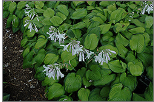
Guacamole Hosta in bloom

Guacamole Hosta will grow to be about 24 inches tall at maturity extending to 3 feet tall with the flowers, with a spread of 4 feet. When grown in masses or used as a bedding plant, individual plants should be spaced approximately 3 feet apart. Its foliage tends to remain dense right to the ground, not requiring facer plants in front. It grows at a medium rate, and under ideal conditions can be expected to live for approximately 10 years. As an herbaceous perennial, this plant will usually die back to the crown each winter, and will regrow from the base each spring. Be careful not to disturb the crown in late winter when it may not be readily seen!