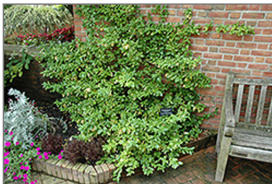
Sarcoxie Wintercreeper