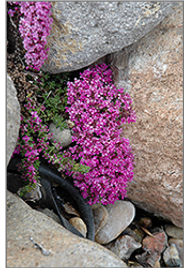
Pink Chintz Creeping Thyme in bloom

This plant should only be grown in full sunlight. It prefers to grow in average to dry locations, and dislikes excessive moisture. It is considered to be drought-tolerant, and thus makes an ideal choice for a low-water garden or xeriscape application. It is not particular as to soil type or pH. It is highly tolerant of urban pollution and will even thrive in inner city environments. Consider covering it with a thick layer of mulch in winter to protect it in exposed locations or colder microclimates. This is a selected variety of a species not originally from North America. It can be propagated by division; however, as a cultivated variety, be aware that it may be subject to certain restrictions or prohibitions on propagation.