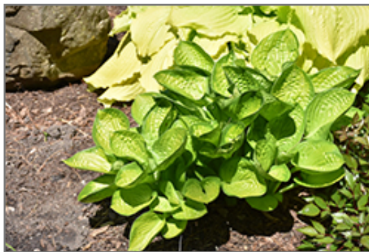
Rainforest Sunrise Hosta