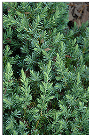
Blue Pacific Shore Juniper foliage