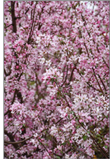
Pink Spires Flowering Crab flowers

This tree should only be grown in full sunlight. It prefers to grow in average to moist conditions, and shouldn't be allowed to dry out. It is not particular as to soil type or pH. It is highly tolerant of urban pollution and will even thrive in inner city environments. This particular variety is an interspecific hybrid.