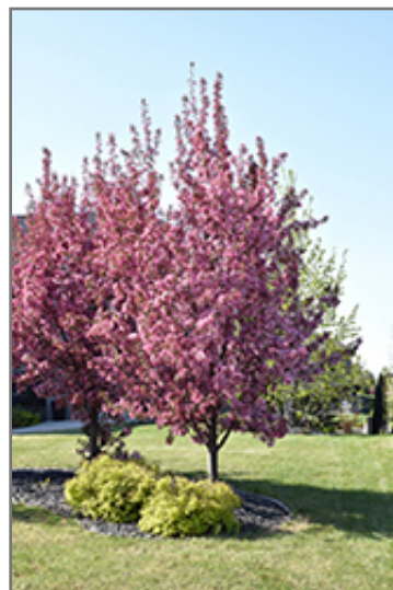
Pink Spires Flowering Crab in bloom

Pink Spires Flowering Crab is recommended for the following landscape applications;